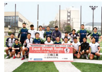
Japan Deaf Rugby Team at the World Championship 2023

We extend donations to universities and research institutes and sponsor cultural activities, including those by the Japan Symphony Foundation and the Kokoro no Gekijo (theater of the heart) project by the Shiki Theater Company. In addition, we support nature conservation activities in developing countries in the Asia-Pacific and other regions, collect donations for training guide dogs, and encourage our employees to donate blood on an ongoing basis. We also help with Mitsui Group social contribution activities through our support for the Mitsui Volunteer Network, which promotes the voluntary efforts of former employees of Mitsui Group companies.