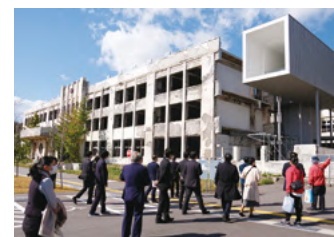
Visiting an earthquake-stricken area

We launched the Earthquake Reconstruction Project in May 2012, a year after the Great East Japan Earthquake, as a Company-wide action team for contributing to the early recovery of the affected areas. Since then, we have conducted various activities each year to support the reconstruction effort, prevent memories of the disaster from fading, dispel harmful rumors, and share information on disaster prevention and mitigation.