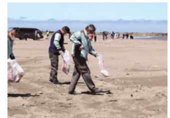
Ocean cleanup in Hokkaido