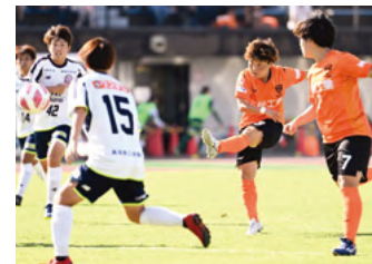
Yamato Sylphid on Sanki Match Day

We are an official sponsor of Yamato Sylphid, a women’s soccer team in Yamato City. We also sponsor the non-profit organization Japan Deaf Rugby Football Union (Deaf Rugby), Japan Handball Association, and East Hokkaido Cranes, an ice hockey team in Kushiro City, Hokkaido Prefecture. By supporting these sports, we continue to contribute to the revitalization of local communities.